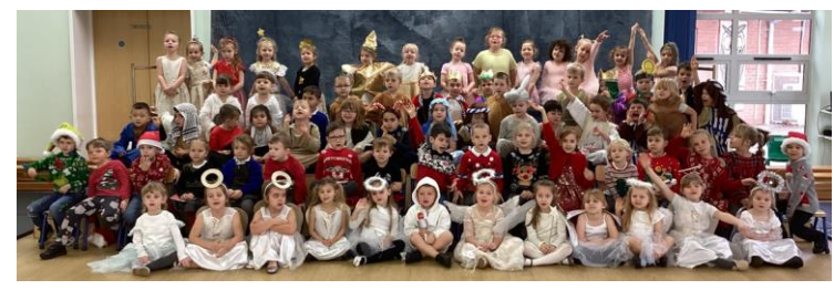
Year 1 Nativity

We continue to ensure an airflow through classrooms and communal areas, whenever possible, and to encourage regular handwashing. We also review our CO2 monitors regularly. However, at the direction of the Government, the school no longer operates under a Covid risk assessment.