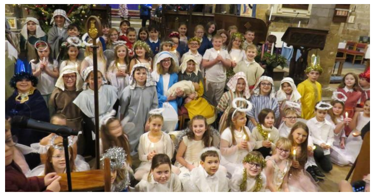
Key Stage 2 Carol Concert and Nativity

On the advice of healthcare professionals, we hold 'Bug Busting' days on a regular basis instead.