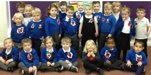
Nursery children in their Poppies.

We raised just over £94 through the sale of poppies in school. Thank you to everyone who donated.