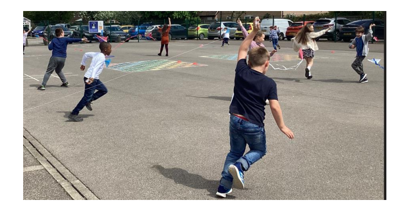
PGL - Caythorpe

Thank you to all the staff who helped to make this celebration so special.