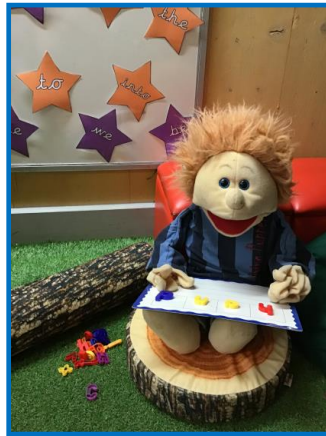
Teacher-led mathematics activity