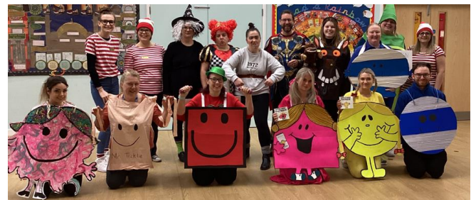
Staff Joining in with the Fun!

Thank you to everyone who supported our World Book Day last term. Our children (and staff!) looked fabulous dressed as book characters.