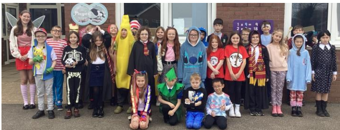
Children in Y4 Celebrating World Book Day

Please remember, in the interest of keeping children safe, no images of children may be taken on the school site without the express permission of the Headteacher. Any images, you have permission to take, must not be posted on social media sites or shared publicly. We also do not allow visitors to use mobile 'phones inside the building.