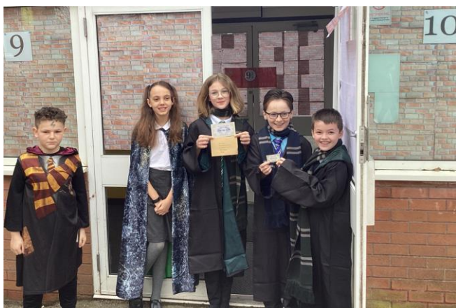
Y6 Wizards on Platform 9 3 / 4 on World Book Day.