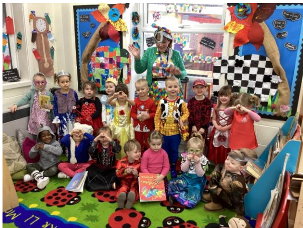
Celebrating World Book Day in Nursery

We received just over £790 in commission from the Book Fair to spend on books for the school, and our children have also benefitted from having some lovely books to read at home.